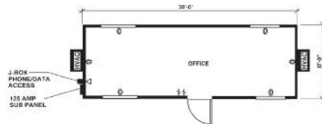
10' x 30' Open Bay Office