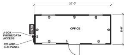
8' x 20' Open Bay Office